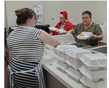
Senior center employees and volunteers prepared meals for the seniors in their community.