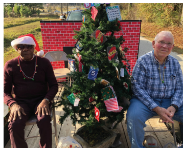
Clients represented the Montgomery County Senior Center with their holiday theme float.

Clients from Montgomery County Senior Center participated in the local holiday parade and rode on a float.