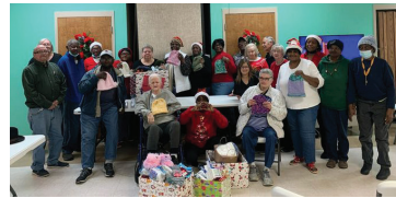
The senior center clients were very proud of the hats and scarves they loomed and donated to the nursing center residents.

Center got in the Christmas spirit by partnering with Pruitt Bethany Nursing Center in hopes of making the holiday season a little more special for their residents. The senior center clients loomed approximately 145 hats and scarves. The hats and scarves, along with socks, slippers, snacks and personal items, were donated to the residents of the nursing center.