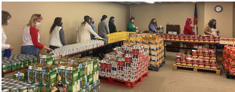
Legacy Link AAA created an assembly line and prepared 1,000 holiday food bags for their clients. Awesome job!

The Legacy Link AAA team also gave back to their community by creating 1,000 holiday food bags! The food bags were delivered to clients all over Legacy Link's 13 county region.