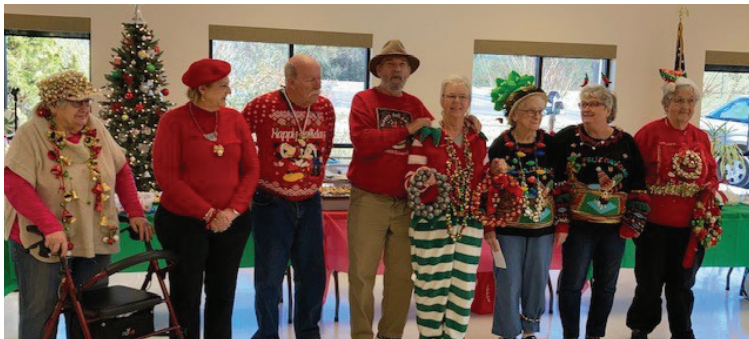
Clients at the White County Senior Center enjoyed their tacky sweater contest.

The Habersham County Senior Center also hosted their Christmas Outreach Project. The senior center accepts donations from the community like candy, socks, lotion and other hygiene products, and the seniors at the center created gift bags. Each year, they pick a local nursing home or assisted living facility to deliver the gift bags to. This year, gifts were provided for the residents at Habersham Retreat, and the group got to deliver the bags to the residents and sing Christmas carols with them.