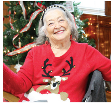
A Candler County Senior Center client was happy to show off her holiday sweater.

Candler County Senior Center and the Emanuel County Senior Center also decorated for and celebrated Christmas.