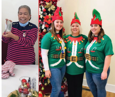
The Pierce County Senior Center's Santa-4-Seniors Project gifted presents to the center's seniors. Also, at the Bacon County Senior Center, seniors enjoyed holiday games, deserts and carols. Great job to the senior centers for getting their community's seniors in the holiday spirit.