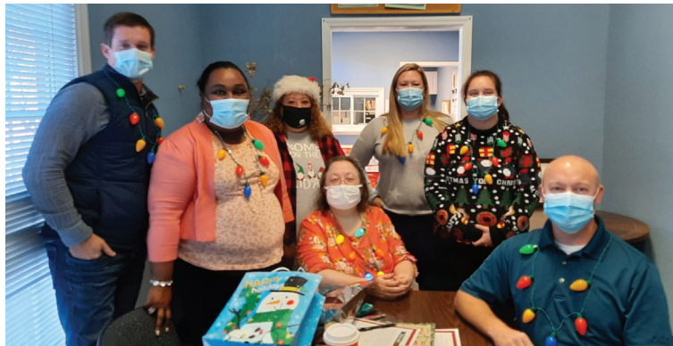
The District A - Northeast Region APS Office is a small, but mighty team. Thank you to all APS staff for your hard work during 2021!