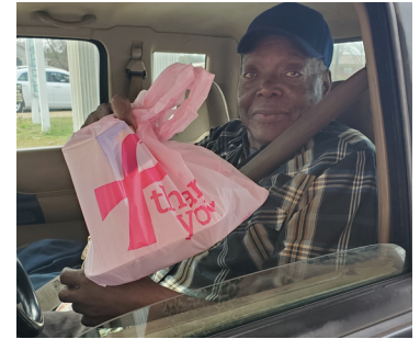
Seniors appreciated the Christmas meal they received from the senior center.

The Wilcox County Senior Center provided Christmas breakfast for the county's seniors. The center is still closed, so the clients picked up their meal from a local drive-thru.