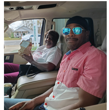
Clients were grateful for the Christmas meal drive-thru event.

These senior centers did a wonderful job helping their senior clients celebrate the holiday season during a difficult pandemic.