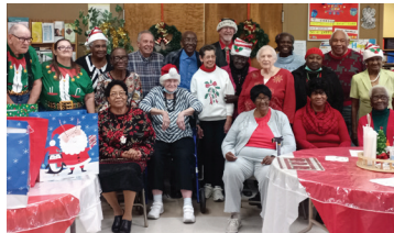
Senior center clients happily joined together to celebrate the holidays.

Clients from Montgomery County Senior Center participated in the local holiday parade and rode on a float.