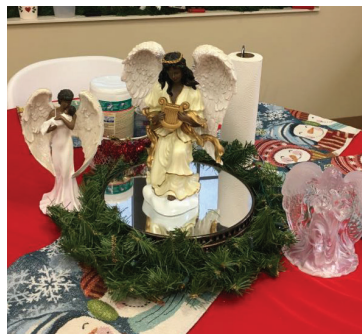
Appling County Senior Center clients and staff decorated for the holidays.

Appling County Senior Center clients and staff decorated for Christmas in December.