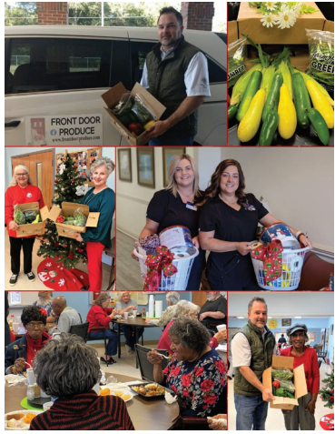
Seniors at the Cook County Senior Center in Sparks, Ga receiving a box of farm fresh vegetables during the center's Christmas celebration.