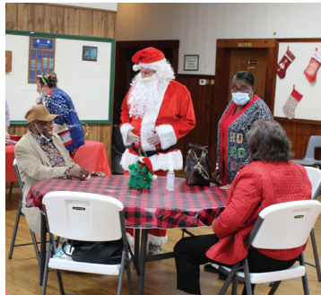
Santa made a stop to visit seniors before returning to the North Pole.